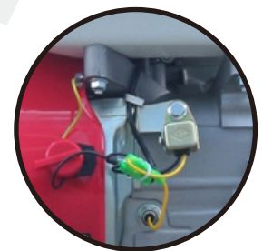
Safety Oil alert built-in