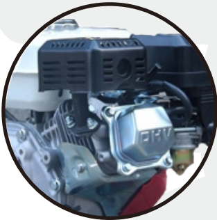
OHV Structure Compact and light weight