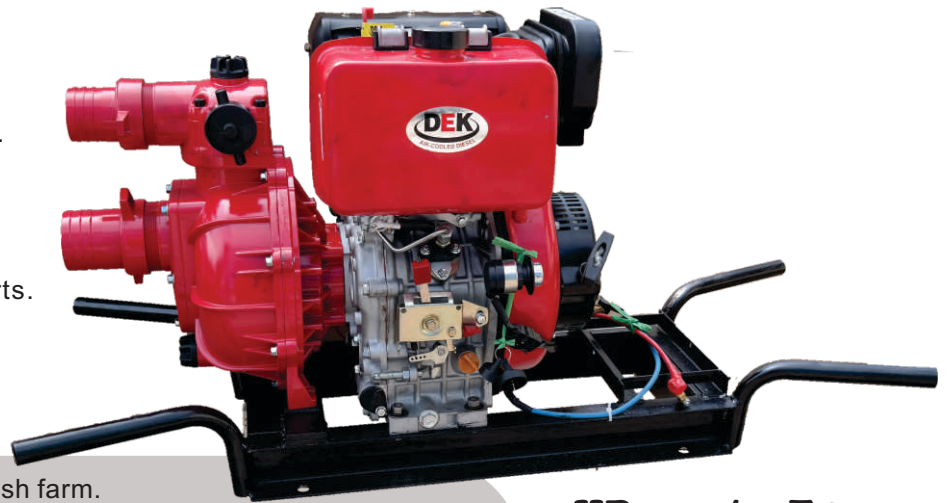
HP-30 c/w F420