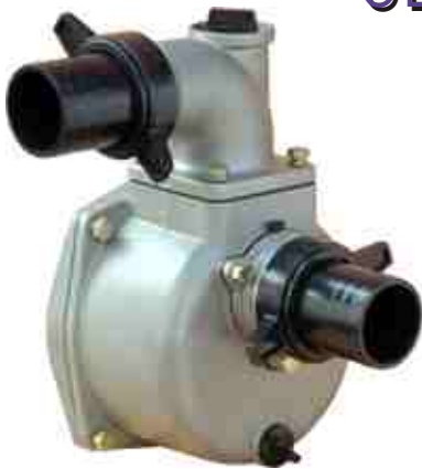
FDP - 200 FDP - 300