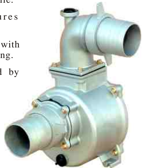
FDP - 400